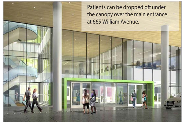
Patients can be dropped off under the canopy over the main entrance at 665 William Avenue.